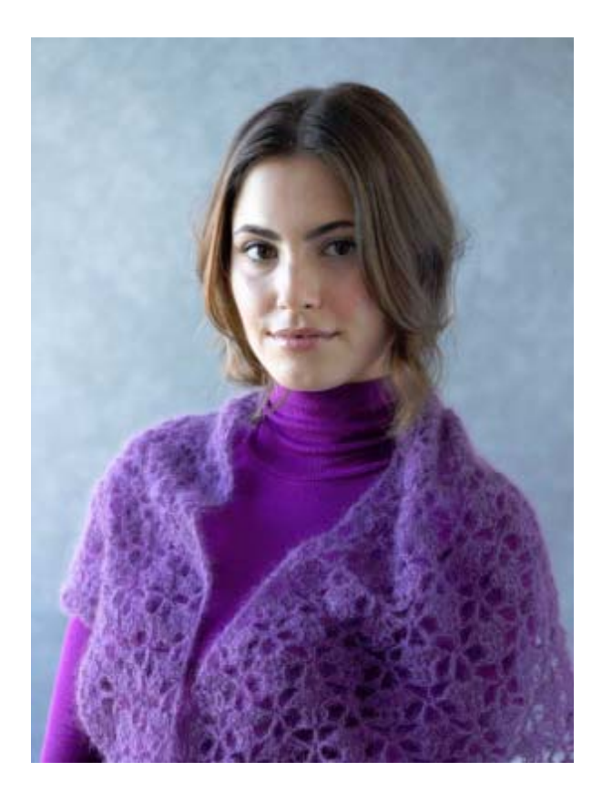
This light and airy shawl is soft and elegant.