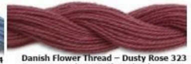
Danish Flower Thread - Dusty Rose 323 Approximately DMC Thread Color - 223