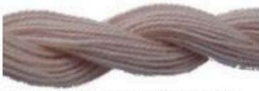
Danish Flower Thread - Pink Beige 25 Approximately DMC Thread Color - 950