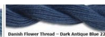
Danish Flower Thread - Dark Antique Blue 228 Approximately DMC Thread Color - 312