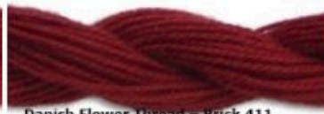
Danish Flower Thread - Brick 411 Approximately DMC Thread Color - 815