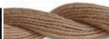
Danish Flower Thread - Tan 250 Approximately DMC Thread Color - 437