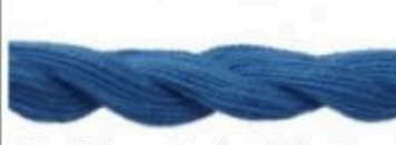
Danish Flower Thread - Sky Blue 22 Approximately DMC Thread Color - 334