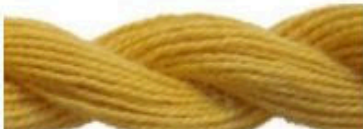
Danish Flower Thread - Buttercup 46 Approximately DMC Thread Color - 725