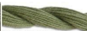
Danish Flower Thread - Light Pistachio 223 Approximately DMC Thread Color - 3348