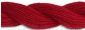
Danish Flower Thread - Dark Red 400 Approximately DMC Thread Color - 321