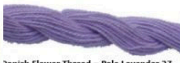
Danish Flower Thread - Pale Lavender 27 Approximately DMC Thread Color - 3041