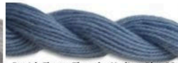
Danish Flower Thread - Medium Blue 304 Approximately DMC Thread Color - 809