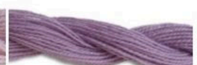
Danish Flower Thread - Light Purple 233 Approximately DMC Thread Color - 553