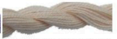
Danish Flower Thread - Light Yellow Beige 28 Approximately DMC Thread Color - close to 951 but less pink