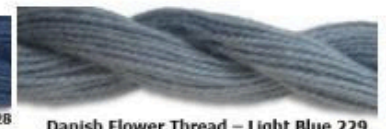
Danish Flower Thread - Light Blue 229 Approximately DMC Thread Color - 375