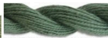
Danish Flower Thread - Light Blue Green 224 Approximately DMC Thread Color - 503