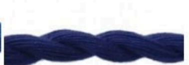
Danish Flower Thread - Blue Violet 23 Approximately DMC Thread Color - 311