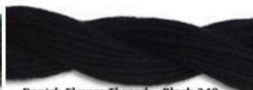
Danish Flower Thread - Black 240 Approximately DMC Thread Color - 310