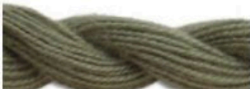
Danish Flower Thread - Gray Green 302 Approximately DMC Thread Color - 3052