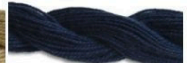
Danish Flower Thread - Dark Blue 220 Approximately DMC Thread Color - 336