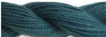
Danish Flower Thread - Sea Green 226 Approximately DMC Thread Color - 806