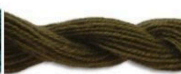
Danish Flower Thread - Olive 212 Approximately DMC Thread Color - 730