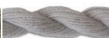
Danish Flower Thread - Pale Gray 303 Approximately DMC Thread Color - 762