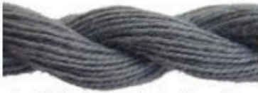
Danish Flower Thread - Steel Gray 20 Approximately DMC Thread Color - 314