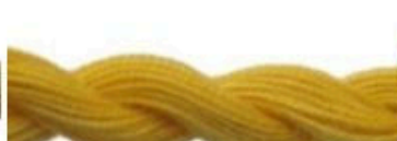
Danish Flower Thread - Deep Yellow 48 Approximately DMC Thread Color - 725