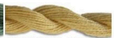
Danish Flower Thread - Pale Gold 225 Approximately DMC Thread Color - 727