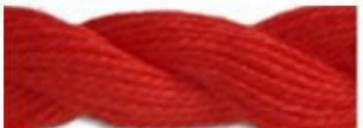
Danish Flower Thread - Bright Orange 504 Approximately DMC Thread Color - 946