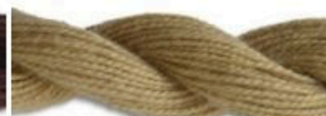
Danish Flower Thread - Golden Beige 218 Approximately DMC Thread Color - 3046