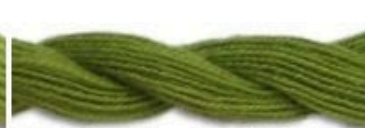
Danish Flower Thread - Light Lime 506 Approximately DMC Thread Color - 906