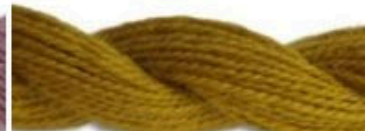
Danish Flower Thread - Mustard 236 Approximately DMC Thread Color - 680