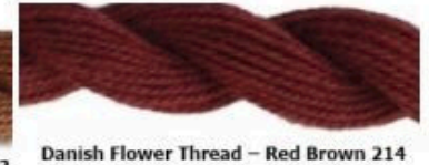
Danish Flower Thread - Red Brown 214 Approximately DMC Thread Color - 400