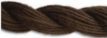
Danish Flower Thread - Gray Brown 215 Approximately DMC Thread Color - 611