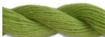
Danish Flower Thread - Chartreuse 505 Approximately DMC Thread Color - 907