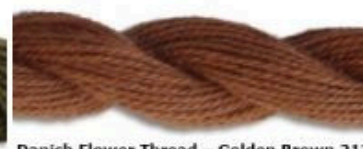
Danish Flower Thread - Golden Brown 213 Approximately DMC Thread Color - 434