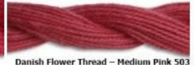
Danish Flower Thread - Medium Pink 503 Approximately DMC Thread Color - 335