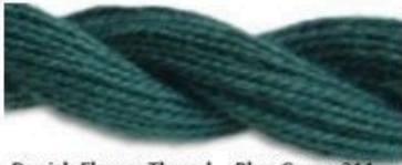
Danish Flower Thread - Blue Green 211 Approximately DMC Thread Color - 561