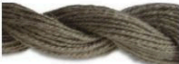
Danish Flower Thread - Gray Beige 222 Approximately DMC Thread Color - 642