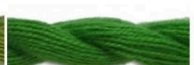
Danish Flower Thread - Kelly Green 507 Approximately DMC Thread Color - 702