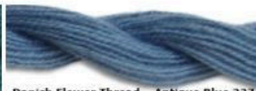
Danish Flower Thread - Antique Blue 227 Approximately DMC Thread Color - 794