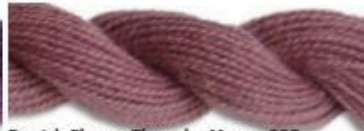
Danish Flower Thread - Mauve 235 Approximately DMC Thread Color - 223