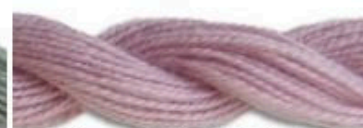
Danish Flower Thread - Light Plum 232 Approximately DMC Thread Color - 3727