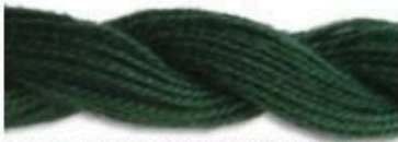
Danish Flower Thread - Forest Green 238 Approximately DMC Thread Color - 699