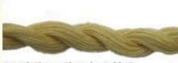
Danish Flower Thread - Gold 47 Approximately DMC Thread Color - 783