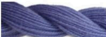
Danish Flower Thread - Lavender 230 Approximately DMC Thread Color - 3746