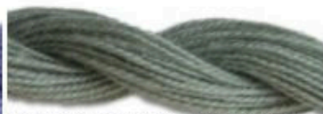
Danish Flower Thread - Light Green 231 Approximately DMC Thread Color - 504