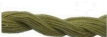
Danish Flower Thread - Light Yellow Green 26 Approximately DMC Thread Color - 833