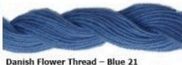
Danish Flower Thread - Blue 21 Approximately DMC Thread Color - 341