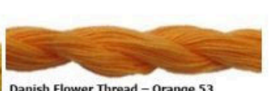
Danish Flower Thread - Orange 53 Approximately DMC Thread Color - 971