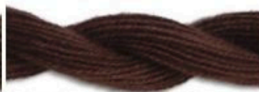
Danish Flower Thread - Mocha Brown 216 Approximately DMC Thread Color - 838