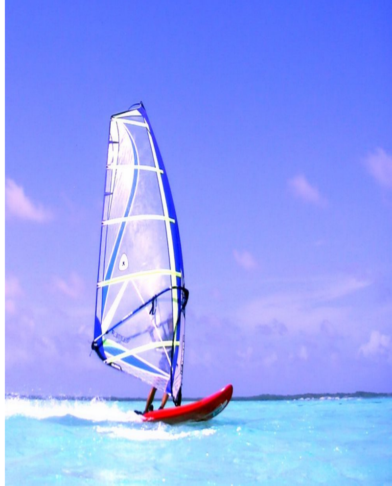
PLANCHE à VOILE