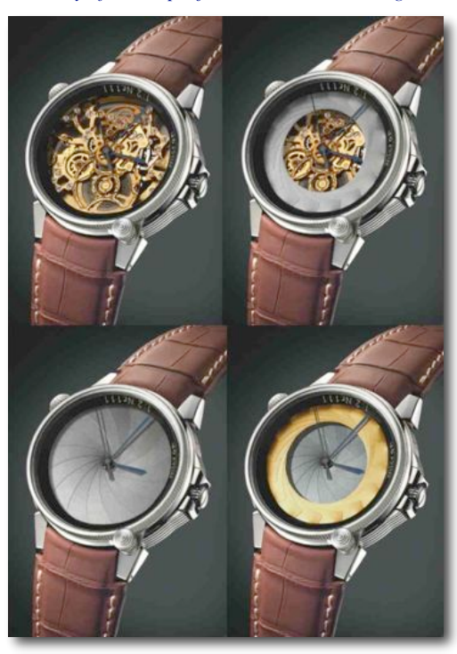
Study of watch project with new case design

Stone settings and customised decoration available as optional extras.