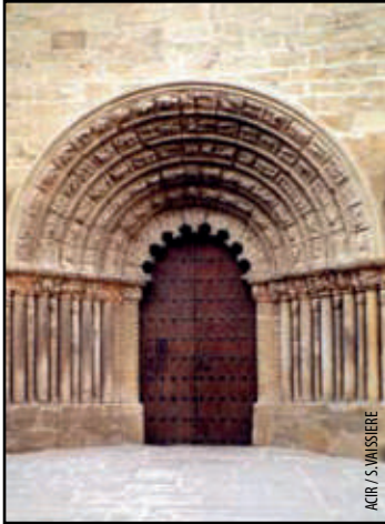
Eglise Saint Jacques Puente la Reina (Navarre)