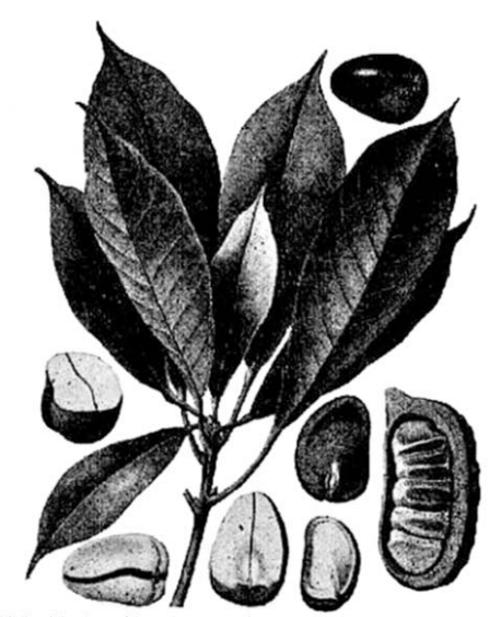
FIG. 176.—Cola (Kola Nut). Showing longitudinal section of fruit \times 36; cross-section of red seed \times 34; longitudinal section of red seed showing embryo \times 35; cross-section of red seed \times 36; longitudinal section of white seed. (After Kohler.)

CAS = chemical abstracts service; CoE = Council of Europe; EINECS = European Inventory of Existing Chemical/Commercial Substances; FEMA = Flavor and Extract Manufacturers' Association; NAS = National Academy of Sciences.