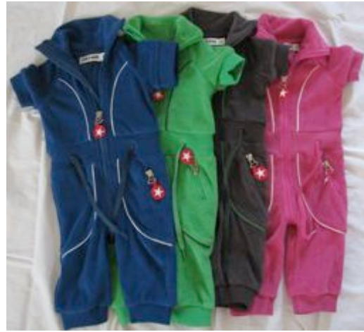
S10 BSU 18K