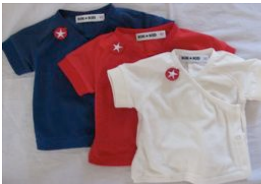
S10 BWS 13K