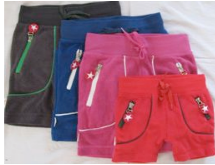
S10 BST/CST 17K