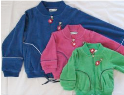
S10 BJA/CJA 19K