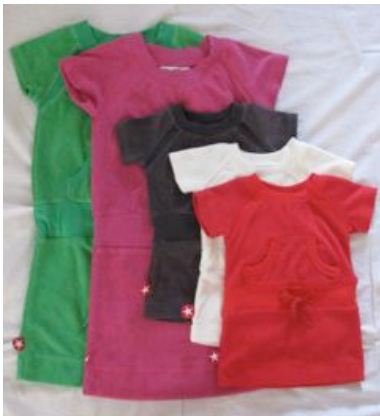
S10 BTS/CTS 16K