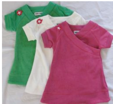
S10 BWD 14K