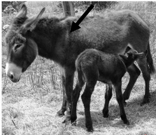
(une) ânesse (UNE) ANESSE