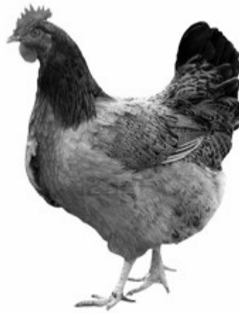
(une) poule (UNE) POULE