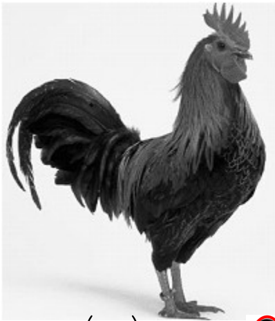
(un) coq (UN) COQ