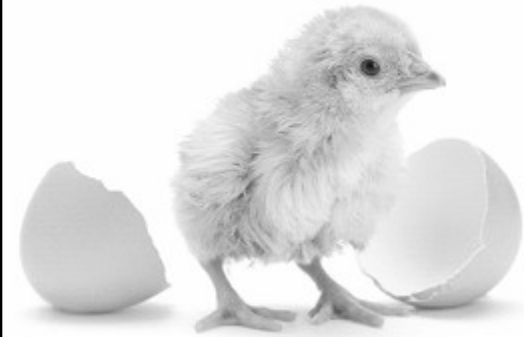
(un) poussin (UN) POUSSIN