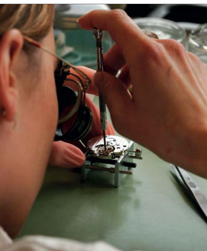
Devoted to producing nothing but tourbillons, Cecil Purnell naturally established its home in a cradle of excellence.