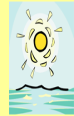
the weather is bright