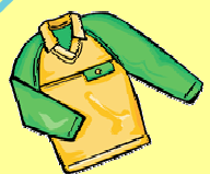
it's often cool