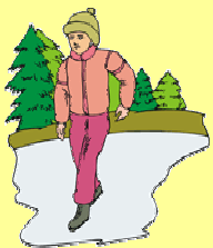
it may be icy