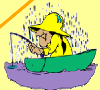
it's generally rainy