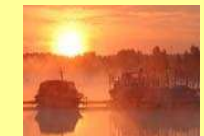
it's sometimes misty