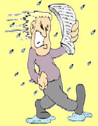
it's usually windy