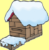
it can be snowy