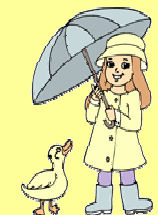
it can be showery