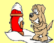
it's always cold