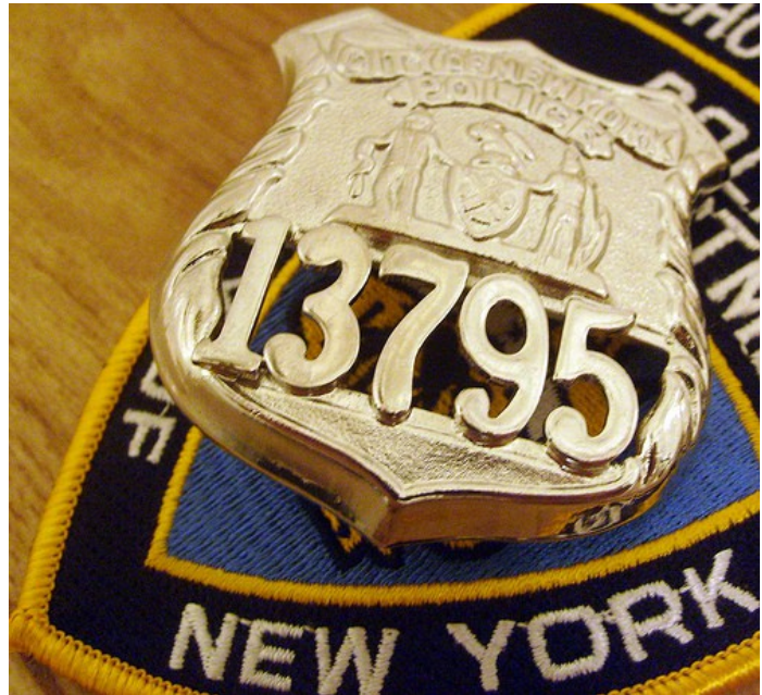
NYPD actual badge (patrolman)