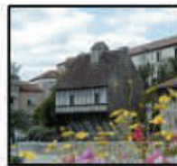
The Old Mill