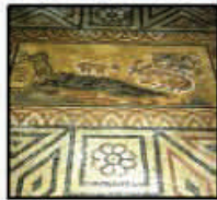
Vesunna : a mosaic