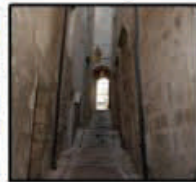
A narrow lane