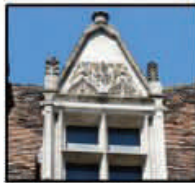
Maison des Conruls