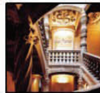
Renaissance stone staircase