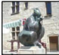
Statue : the Source