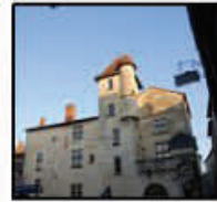
La Maison du Pâtissier