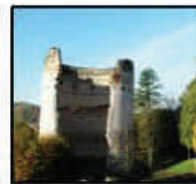
The Vesunna Temple