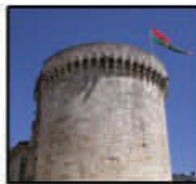
The Matagne-re Tower