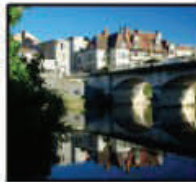
The river Isle