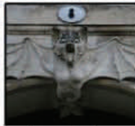
A strange bestiary