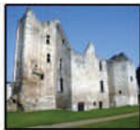
The Barriere Castle