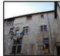
Beautiful 15C to 17C façades