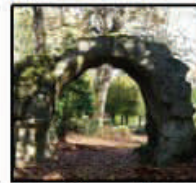
Ruins of the amphitheatre