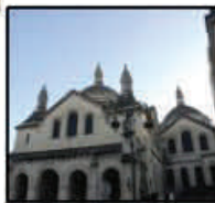
St. Front's Cathedral