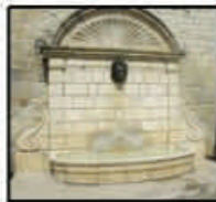
Fountain with a lion head