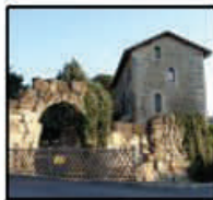
The Norman Gate