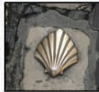
St. James' Way