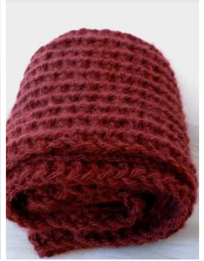
Bee made - 2013